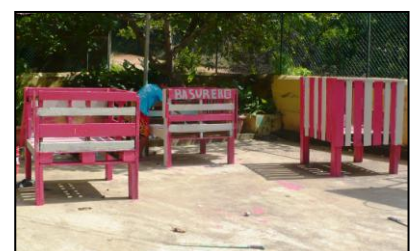
Colorful trash receptacles in Mud Hole

As part of a community based project in Mud Hole, children from the Toribio Bustillo School were very busy this past month painting trash can holders that they had previously constructed. Hopefully the new colorful holders will grab people's attention and encourage them dispose of their trash properly, helping keep the reef and mangroves clean!