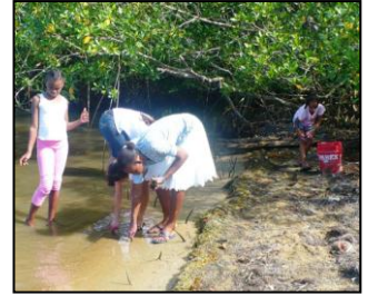
Kids planting mangrove seedlings

It's very sad what's happened to many of the mangroves throughout Roatan, especially in Mud Hole and Corozal. Many have been cleared and destroyed in the name of development. Knowing the importance of this vital habitat to the wildlife of Roatan, the RMP gathered mangrove seedlings that had washed ashore in West Bay and Half Moon Bay during a storm. The RMP then brought children from the Toribio Bustillo School to help replant the seedlings in Mud Hole. The kids also committed to looking after them for the next few months and hopefully over the years this area will re-grow to its previous glory.