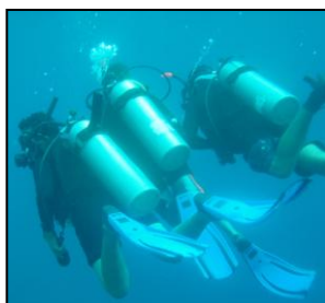
Kids experiencing their first dive

We are happy to say that the RMP (in conjunction with several dive shops) is providing diving scholarships for locals. The project, which was on stand-by for more than a year, has been re-launched thanks to funds from PMAIB. Its purpose is to provide locals an alternative livelihood that would further incorporate them in the diving business. Local high school students who have shown exceptional interest in reef conservation are also eligible for similar scholarships. In November, the scholarships allowed the certifications of one EFR, one DiveMaster, and three open waters. We would like to invite dive shops interested in becoming a part of this project to contact us.