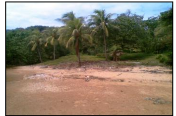
Site in West Bay for the proposed desalination plant

A proposal for the installation of a desalination plant in West Bay was presented to SERNA and an inspection was made to the site. The plant intends to collect 250,000-500,000 gallons on sea water per day and provide potable water to around 10,000 people. A major concern with this project is what so do with the salt that is left behind in the desalination process. The company is proposing to use long pipes with diffusers to return it to the ocean far away from the reef.