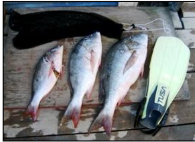
The speared snapper found at El Aquario

We found the speargun hidden in wet towels on board. The diver claimed he found it while diving but this was a complete lie and all evidence proved this. The captain of the vessel was told to report to the Port Captain's office the following morning. Meanwhile, divers from Coconut Tree returned to the scene of the crime and found the bag contacting the fish hidden under rocks by the mooring line. The next day, the captain of the boat still denied the crime yet agreed to make a donation to help maintain the yacht moorings and the guilty diver had all his dive gear confiscated. We hope that the story of this incident will circulate throughout the yachting community so others will think twice before breaking the rules.