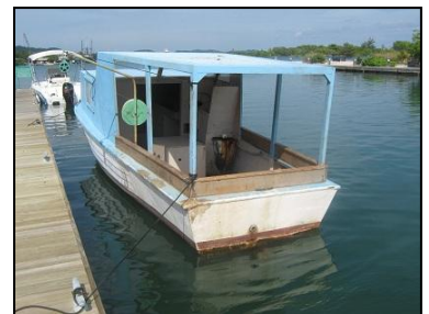
Boat found with 50 lobsters on board

At the end of October, there were two incidents which were not mentioned in last month's newsletter. The first occurred when an early patrol near Parrot Tree discovered a man diving for lobsters. Approximately 50 lobsters of all sizes were confiscated, the boat was impounded for 72 hours, and the owner was jailed for 24 hours. The second incident involved a 300 meter long net in the lagoon behind Cocoview and Fantasy Island. Luckily