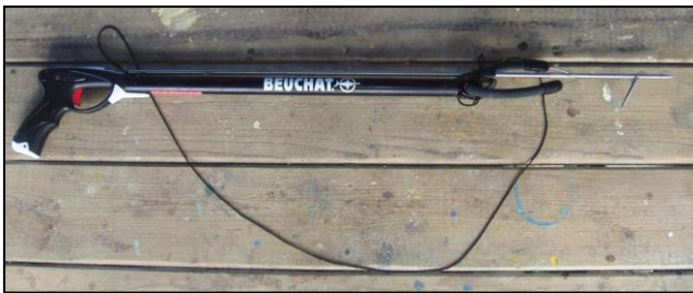
Speargun confiscated from yacht in the West End mooring field

In just one week there were 3 incidents involving yachts in West End, coincidentally all of them involving European owners. The first two incidents occurred on the same day in the yacht mooring field between West End and West Bay. While inspecting the yachts, our Park Ranger noticed several snorkelers near the shallow reef waving at a yacht. He then saw a person with a speargun climb into a dingy and head towards the snorkelers. Before any damage was done, our Ranger confiscated the speargun and told the owner to report to the office.