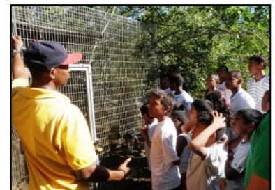
Eco-rangers at Maya Cay