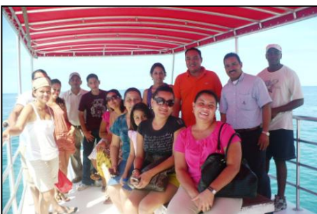
Teachers from Arobia Welcome on the GGB