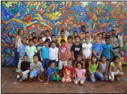
Eco-ranger members by the collage at AKR