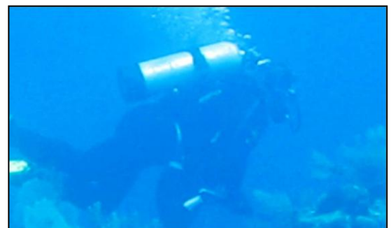
A still taken from a video clip of a diver spotted with speargun and bag of fish near the El Aquario mooring