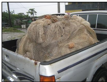
300m net found near French Cay

At the end of October, there were two incidents which were not mentioned in last month's newsletter. The first occurred when an early patrol near Parrot Tree discovered a man diving for lobsters. Approximately 50 lobsters of all sizes were confiscated, the boat was impounded for 72 hours, and the owner was jailed for 24 hours. The second incident involved a 300 meter long net in the lagoon behind Cocoview and Fantasy Island. Luckily