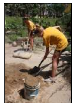
Volunteers collecting sand

For many years a group of women from the community of Gravel Bay have been working on the construction of an Eco Conservation Center out of plastic bottles. The plan is to build a center that can be used to give trainings. Due to lack of both human and financial resources, this has been a dream for the community, however, thanks to the support from the volunteer group from the University of North Carolina this is closer to being achieved.