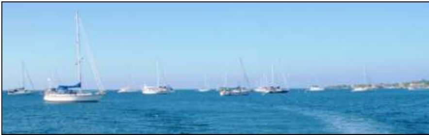
Yacht mooring field between West End and West Bay with over 20 visiting vessels moored up

The yacht mooring field in front of Luna Beach has been running close to 90% capacity for the past few months, with boats sometimes having to anchor in allotted sandy areas during really busy periods. To simplify the process of informing new vessels on mooring fees and checking people have paid, we've employed the services of a Host Vessel to be responsible of these chores in return for free anchorage. This year we've been accumulating the money generated from the mandatory mooring fee and after meeting with the West End Patronato, we've finally decided what to spend the funds on. Other than the obvious maintenance of the yacht moorings which is a necessity to ensure the sustainability of the project, it was decided that the school in West End should be provided with a photocopying machine, the swim zone in Half Moon Bay be constructed, and that the Patronato should be officially registered under the Municipality. We hope for the rest of the season it will remain as busy so we can accomplish other projects needed to be addressed in West End.