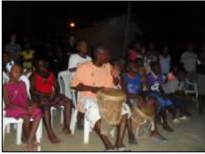
Drumming with the community of Punta Gorda

Punta dance, selling of crafts, bonfire, fire dance and lots of eco tips were part of the celebration of Earth Hour in Punta Gorda on March 26 th . Turn the lights off, turn on the planet, was the phrase for this year. Several candles were turned on at the beach for one hour with kids from the community. Singing and dancing of traditional songs, were the best things to do to