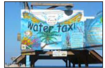
New sign at the water taxi dock in W.E.