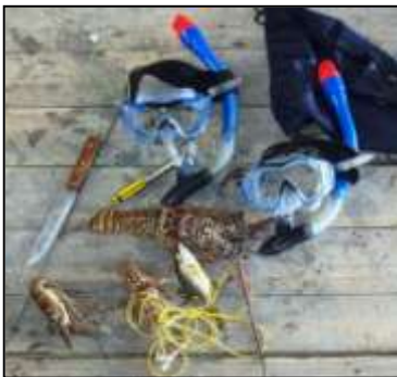
Masks, lobster and a speared fish

There was only one noteworthy incident in the SBWEMR in March, with 2 individuals apprehended in Sandy Bay with lobster and a speared fish. The two had been reported poaching from a dory the evening before but our patrols had missed them by literally minutes. The next afternoon, they were out on the water again and it was a simple process of apprehending them. The men had moved from Oak Ridge to Sandy Bay that week and denied knowing that spearing or taking lobster and conch was illegal. They had borrowed the dory from a Sandy Bay resident and were simply trying to feed themselves. After explaining the rules and regulations and informing them if they're caught again they would spend 24 hours in jail, they were sent on their way but without their gear or catch. While most people caught by our Patrols deny knowing the rules, we felt that these two genuinely didn't have a clue.