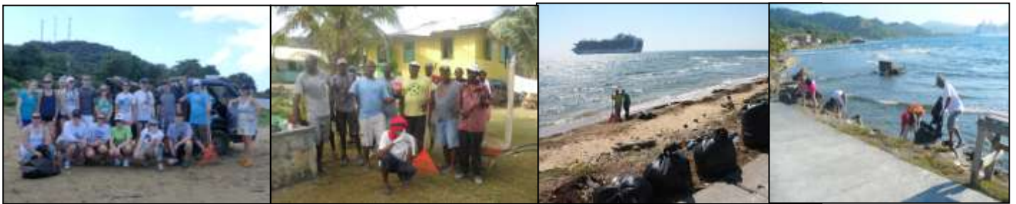
Trash was removed from Sandy Bay, Gravel Bay, Flowers Bay, beach between West End and West Bay, El Berrinche, Punta Gorda and Oak Ridge.