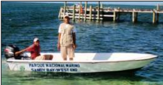
RMP Ranger on board the BICA boat with their captain

The dory was finally collected by its owner two weeks later after being informed that if he didn't collect it immediately, it would promptly be cut up and turned into a planter for the shop front.