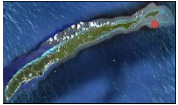
Dot indicating the location of Little Pigeon Key all the way to the east of Roatan, just to the south of Barbareta

For the next few days our patrol boat attempted to check the key but due to weather they were never able to. The following week the cold front arrived and the heavy rains removed any chance of catching the culprits. After talking to several tour operators, we found out that this wasn't the first time that fishing boats from the mainland have camped on the key and killed all the conch, fish, turtles, sharks and other marine life. We hope that the next time these fishermen return to Roatan, we can coordinate apprehending them with the assistance of the seaplane and several boats and confiscate all their nets before they do further damage to this pristine area. If you do see anyone on the keys, please contact us immediately so we can stop any further killing of marine life.