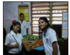
School groups from ESBIR

Like every year in March, an exhibition of science projects was carried out by children of the ESBIR School. The topics for the projects varied between biology, environmental science, chemistry, physics, health, microbiology and more. The RMP was asked to be a judge at the Fair and evaluate the projects from the 3 rd grade. We would like to congratulate all those that competed and to this year's 3 rd grade winning projects which were Roatan's endemic Iguana and the making of compost.