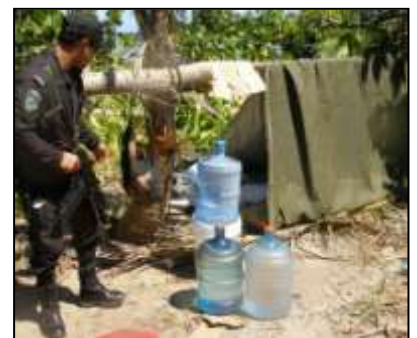
Policeman searching the fishermen's camp site on Little Pigeon Key

After receiving a report that fishermen from the mainland were living on Little Pigeon Key, fishing out everything in the vicinity, we sent our patrols to Roatan's far east to apprehend those involved. With choppy seas, it took Richard over 2 hours to reach the Key from Cocoview Resort. Accompanied by police from Oak Ridge, they searched the island and found a large campsite the fishermen had inhabited for the past week. Water bottles, Dramamine pills, cooking stoves, old refrigerators used for sleeping quarters, hammocks, even the remains of a shark, the key was full of evidence but sadly no fishermen. With restricted gas, they were unable to search for the 4 fishing boats which apparently set nets all around Barabareta, however they were able to confiscate a gill net which they found at the camp.