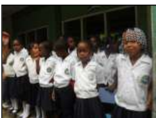
Kids from the Punta Gorda School

Because environmental education should reach children not only within the SBWEMR but all around the island, several visits were made to schools in Punta Gorda, French Harbor, Brick Bay and Oak Ridge this past month. Reef conservation and recycling were the main topics taught and hopefully the kids learnt a lot from our staff and volunteers. With our Director of Education, returning next month, our education program will return with more force.