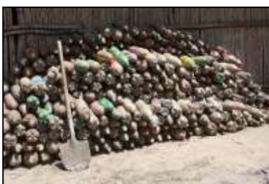
Stacks of sand filled plastic bottles constructed to replace concrete blocks

For many years a group of women from the community of Gravel Bay have been working on the construction of an Eco Conservation Center out of plastic bottles. The plan is to build a center that can be used to give trainings. Due to lack of both human and financial resources, this has been a dream for the community, however, thanks to the support from the volunteer group from the University of North Carolina this is closer to being achieved.