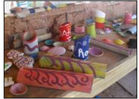
Local handicrafts made in Punta Gorda

Punta dance, selling of crafts, bonfire, fire dance and lots of eco tips were part of the celebration of Earth Hour in Punta Gorda on March 26 th . Turn the lights off, turn on the planet, was the phrase for this year. Several candles were turned on at the beach for one hour with kids from the community. Singing and dancing of traditional songs, were the best things to do to