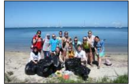
Volunteers from University of North Carolina