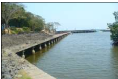
Marina illegally constructed on Barbareta

Not only are resorts, marinas and cruise ship docks within Roatan and Santos Guardiola visited by SERNA for environmental licenses, but also projects located further afield. After two years of having requested their environmental license, the marina in Barbareta was visited by SERNA along with the members of the local SINEIA (National System of Environmental Impact Assessment), integrated by representatives from RMP, BICA, ZOLITUR and environmental unit from the Municipality of Roatan. An inspection was conducted around the island and the results: mangrove cuts, wildlife in captivity, wall on the beach, dredging, fillings in the wetland and sea and a road around the island, all with no permits. Fines look likely for these infringements but who knows?