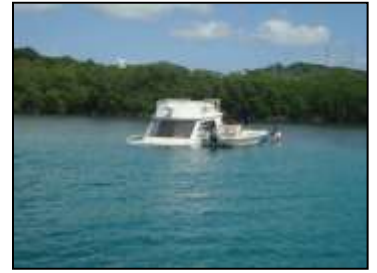
Boat aground near Jonesville

With the purpose of documenting the state of the ecosystems on the coastline of the north and south bands of the island, a joint inspection was made by the RMP and ZOLITUR on board our patrol boats. The main findings were new mangrove chops close to the area of Mud Hole, stealing of sand from Camp Bay and a boat grounding near Jonesville. All these cases were forwarded to the authorities and as always, all we can do is wait and see what happens.