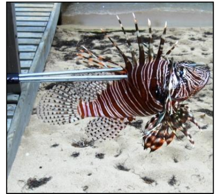
Adult lionfish speared in Camp Bay

On June 18 th , the RMP volunteer team led the first Lionfish Huntathon. A minibus full of thrill seekers headed to Camp Bay to educate the local fishermen about lionfish and catch a few in the process. After a swift briefing on the Hawaiian Sling and lionfish safety, the hunting squad took to the water with murderous enthusiasm. Despite their efforts, they only managed to kill two large specimens. Despite the meager total, it remained a highly enjoyable outing and spirits were kept high with superb hospitality from the Adventure Hostel and perfect snorkeling conditions. The RMP hopes to continue running the Hunt-a-thons and spreading the word about lionfish control to all parts of the island. For anyone interested, it is a great way to see some of the more remote areas of Roatan, meet new people and do your bit to protect the reef.