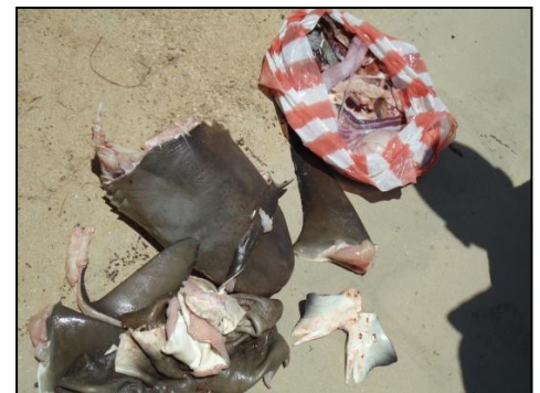
The remains of a shark killed in West Bay