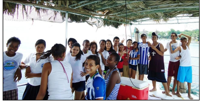
Kids from the Guardiola school on the glass bottom boat in West Bay