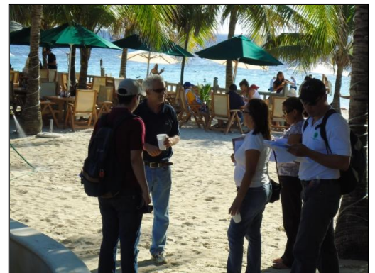
Inspection at Infinity Bay in West Bay

In the last week of June, a series of inspections were organized throughout the island with representatives from SERNA, BICA, RMP, ZOLITUR, and UMA invited to attend. The places visited included Infinity Bay Beach Resort, Maya Lounge in Half Moon Bay, Blue Ocean Reef, Bojangles in Coxen Hole, Cocoview Resort, and several other locations. At the end of the inspections, representatives from the different organizations gave their opinions on the proposed renovations to the developments and how they could minimize their impacts on their surroundings. Hopefully, under the supervision of the Municipality, any recommendations made during the inspections will be followed.