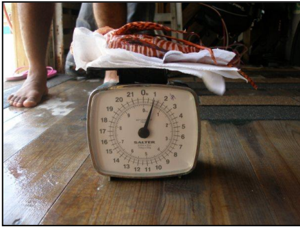
Largest specimen caught to date at >1lb