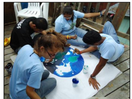
Volunteers from Puerto Rico painting eco themes