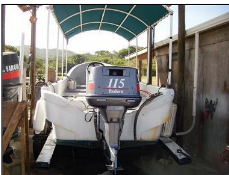
South side patrol boat with new engine

After struggling with an unreliable, hand operated 60hp engine for almost a year, we have, at long last, constructed a console and purchased a relatively new engine. The 2-stroke, 115hp Yamaha engine will enable our patrol to respond quicker to calls regarding poaching and other illegal activities. This month, despite rough seas, we managed to confiscate 4 spears and 1 hook. While patrols operate primarily between the airport and Oak Ridge, we receive numerous reports from Maya Cay about illegal fishing. To reduce costs and response time, we send staff from West End and use boats provided by Maya Cay to arrest the offenders.