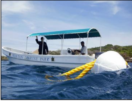
South side patrol boat checking dive moorings

In anticipation of the bad weather in the coming months, we thought it time to renovate the dive moorings on the Southside. In total, five dive moorings were replaced and seven buoys were changed. The moorings replaced were at Carib Point, Forty Foot Point, Connie's Dream, Mr. Bud's Wreck and Half Moon Bay. Also, the mooring from Sponge Garden was removed as the block was damaging the coral when the mooring was in use. We will continue to check the moorings in the coming months but urge divers on both sides to call and report any damaged or missing mooring you may come across.