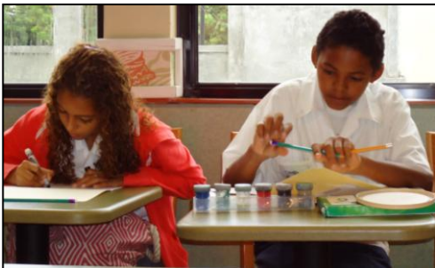
Kids drawing ocean themes for Environmental week