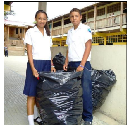
School kids with bags of plastic bottles

Roatan is continuing to struggle with development, people, and the trash we produce. To combat this, the Marine Park continues to drill the importance of the 3R's: Reduce, Reuse, Recycle into the minds of the school children we visit. The first week of June was deemed Environmental Week in an effort to increase awareness worldwide. As part of Environmental week, the Marine Park organized a contest between kids from different parts of the island. The objective of the competition was to recycle the most Pet-1 plastic bottles with the winner receiving 1,000 lempiras to go towards the construction of a greenhouse at the winning school. The competition ends July 23 rd and all of the bottles collected will be sent to the city dump for recycling. We wish the kids luck and hope for more schools to become involved in recycling.