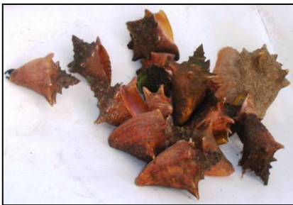
A small proportion of the conch relocated

Five other incidents failed to result in the arrest of the perpetrators due either to lack of police or those involved being underage. During the first week of June, a local fishermen and previous Marine Park employee chased people out of Tom Fools Bight, a shallow bay next to Gibson Bight. They'd been collecting conch and fortunately had yet begun popping the shells. In total, over 80 conch were collected and relocated to a safer location. Other incidents also included the capture of 3 kids spearing fish in Sandy Bay, while another involved a kid collecting conch and lobster again in Sandy Bay.