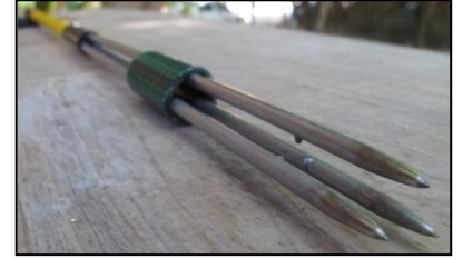
Sling with a hose over the prongs to make shooting small lionfish easier

It appears that the lionfish are here to stay and all we can do to control their numbers is continue to actively hunt them on dives and while snorkeling. With over 100 official spears distributed throughout the diving community, we are making a small dent in their population, however to really make the project island wide, we must now focus on educating local fishing communities outside the Reserve. Quick note, we now have spare rubbers for the slings and to make the prongs smaller, we use hose.