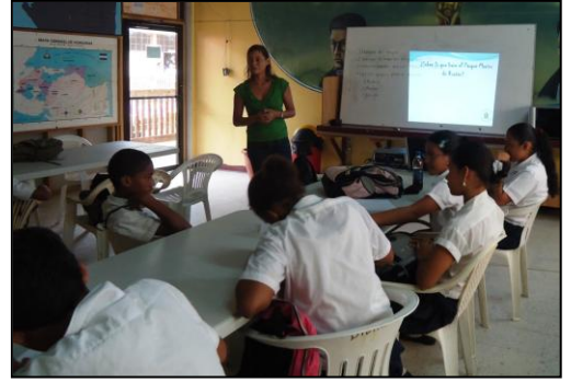
A volunteer teaching the kids from the Guardiola School

During July and August, our staff and volunteers visited 6 schools and addressed a total of 1,073 students. The main topic of focus during these visits was solid waste management, which included information on the recycling of PET-1 plastics, how garbage affects the environment, and classification of waste into organic and inorganic matter. We visited all the students in the 7 th , 8 th and 9 th grade who attend classes in the morning from Guardiola School. After our waste tutorial, the students were fortunate enough to be taken on the glass bottom boat in West Bay. We would like to thank all our volunteers, Monica, John and Annick, who spent their time visiting schools and taking the kids on Mondays to West Bay.