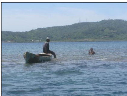
Suspected poachers searching for conch and lobster near Brick Bay