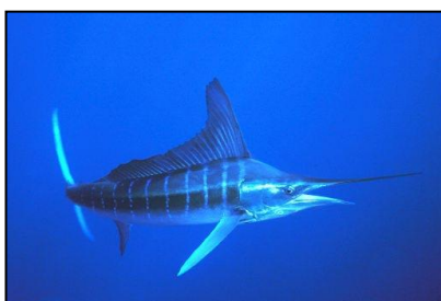
A huge billfish in all its glory

The Roatan Fishing Tournament will again be taking place this September. Several meetings have been held at the Municipality to coordinate this year's regulations for the tournament, which include the release of all billfish below 700lb (the local record for Blue Marlin is 708lbs). A leaflet containing the rules and regulations within the Marine Park will be given to every contestant the day of registration in order to keep everyone informed about the do's and don'ts.