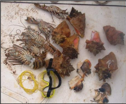
Conch and lobster confiscated in Sandy Bay

In the past two months, there were 15 incidents which resulted in the arrest of 8 individuals and the fining of 2 others. In addition, a minor was made to empty the recycling bin in West End. A total of 5 masks and fins, 4 gaffs, a 400ft net, and a fish pot were confiscated. We also seized 23 lobster, 7 fish, and 60 conch, 8 of which were later released.