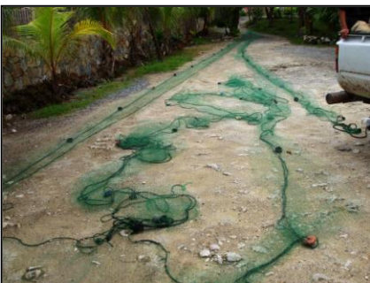
Gill net confiscated in Gibson Bight