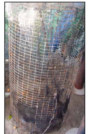
Fish trap found by our Rangers near Mud Hole