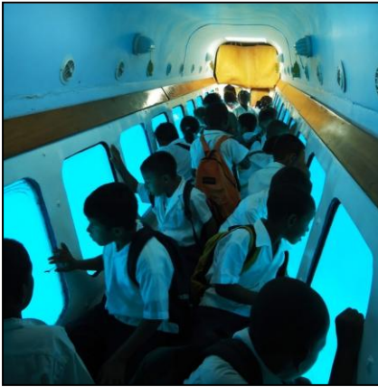
For some children, this is their first glimpse of the reef that surrounds their island

The RMP has been working with the glass bottom boat in West Bay for over 4 years. Since April 2010, our staff and volunteers have visited 11 schools from around the island and lectured to almost 2,000 kids. From those, over 700 have been fortunate enough to see the wonders of Roatán's reef first hand. When visiting schools, we teach the students about the reefs, its inhabitants and their importance, as well as a host of environmental subjects. To reinforce the importance of the reef and the fact that they're the guardians of this fragile ecosystem, we provide them with an intimate view of the coral, fish and other strange marine creatures. As they load onto the boat, the kids are excited about their adventure ahead. For some, this is the first time they'll experience the wonders below the waves. Even though they live on an island, many can't swim or have ever seen coral. Their first view is the vast expanse of seagrass inside the lagoon, and then as they near the channel, with faces pressed against the glass, the reef slowly materializes before their eyes.