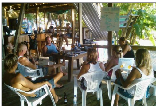
Representatives from the RMP and CRLN meet with Reef Gliders’ owners and staff to discuss voluntary standards