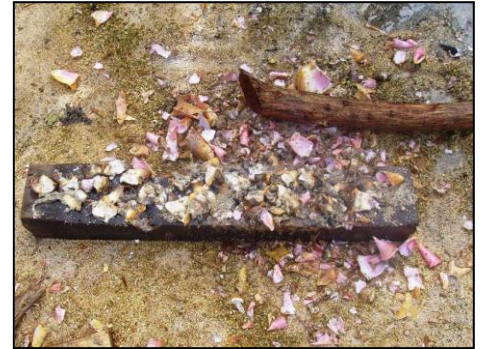
Over 30 juvenile conch smashed near AKR

In the past two months, there were 15 incidents which resulted in the arrest of 8 individuals and the fining of 2 others. In addition, a minor was made to empty the recycling bin in West End. A total of 5 masks and fins, 4 gaffs, a 400ft net, and a fish pot were confiscated. We also seized 23 lobster, 7 fish, and 60 conch, 8 of which were later released.