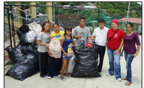
Students displaying the bags stacked full of plastic bottles at the Santos Guardiola School

As mentioned in June's newsletter, the RMP hosted a recycling competition between Arobia Welcome School in Los Fuertes and Santos Guardiola School in Coxen Hole. The winning school was to receive 1,000 lempiras to go towards the construction of a green house. Since both schools did such a good job, collecting almost twenty-five 55 gallon bags of plastic bottles per school, the competition was deemed a tie. The prize money was split between the two schools, who are continuing their recycling efforts. With help from Serranos Hardware, all the plastic bottles collected will be delivered to the Municipal Dump each week for recycling.