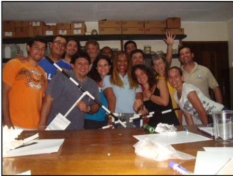
Attendants of the AGRRRA course celebrate finishing