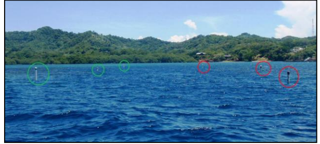
Six new channel markers indicating the entrance to Gibson Bight

With the Honduran Independence Day only weeks away, that can only mean that the Annual Fishing Tournament is just around the corner. Over the weekend of September 17 th , dozens of fishing boats will amass in Half Moon Bay for the annual tournament. While many of the fishermen are from the islands, others have travelled from the mainland or further afield and will require a safe harbor for their boats. The new marina in Gibson Bight will be offering its services to competitors and requested that the RMP help demarcate the channel. After renovations, there are now 6 markers, 3 green and 3 red, indicating safe passage into the bight. A solar powered beacon will be added to a marker shortly, bringing the total number of beacons within the SBWEMR to 5.